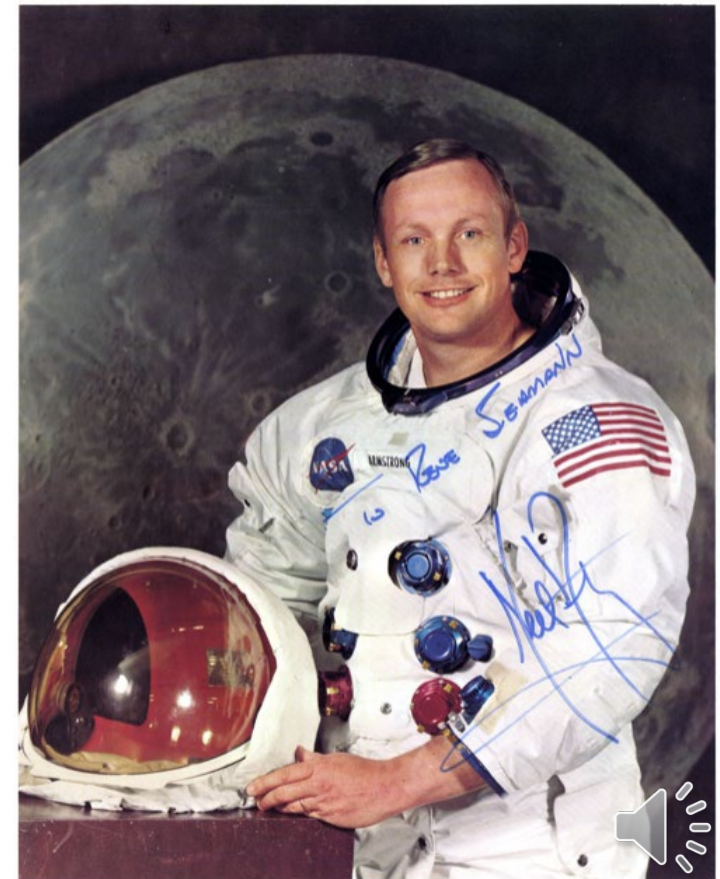
NEIL A. ARMSTRONG

Your mission today is to examine sources of evidence for both points of view and come to your own conclusion.