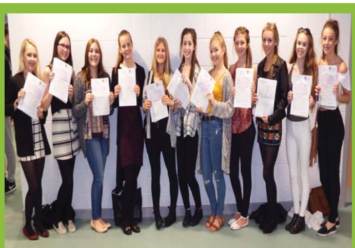
Group of Year 11 Girls on Results Day

All of these pupils had one thing in common, they all worked their socks off! This year's Year 11 are already preparing for their final hurdles and are looking forward to beating these fantastic results.