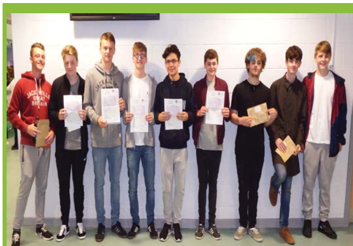
Group of Year 11 Boys of Results Day