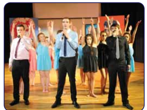
(Above) Students performing the Take That song 'Greatest Day,' which they showcased in the Ukraine, in a National Talent Show.