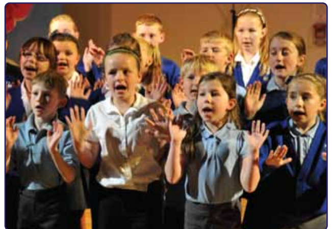
Pupils from Castletown Primary School performing one of the songs from the 'City Sings' competition.