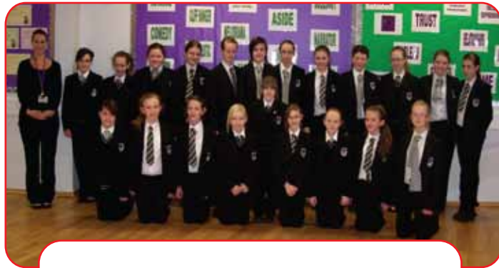
The CVEA 'Glee Club' Choir

The students had a thrilling and memorable experience. They performed two songs, 'Hallelujah' and 'Marry You', both receiving an amazing reception from the audience.