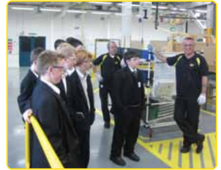
Students working on their cabs (left) and receiving some tips on safety (above)

The students returned to the production line in the afternoon and after implementing changes, such as move parts to ease access and change order of assembly, the teams worked more successfully.