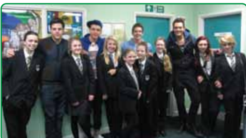
Students pictured with the boys from FTW

We would like to thank the boys for taking time out of their very busy schedule to come to our Academy to perform for us.