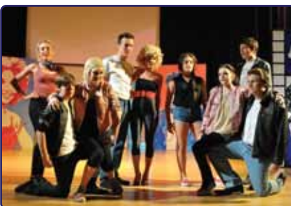
Students performing a routine from the recent Grease Musical.